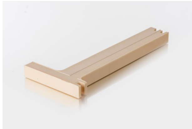
Alumina structural ceramics for use in fuel cells