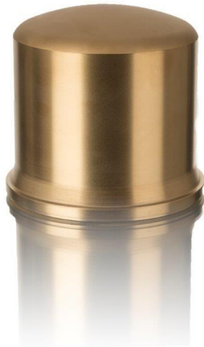
Containment shell (TiN coated)