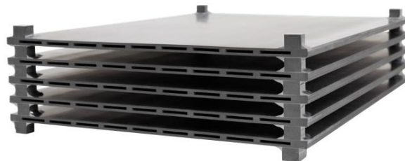
Silicon carbide ceramics for use in heat exchanger systems